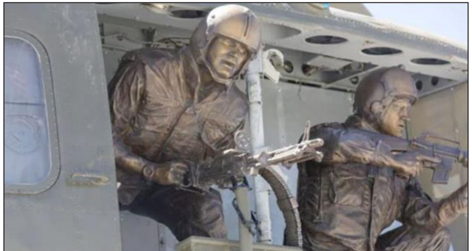
A restored U.S. Army UH-1 Huey, frozen in flight above one end of the memorial plaza.