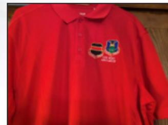
Short Sleeve 55th Association Polos White, Red, Royal Blue, Dark Navy. (S-XXXL). Cost $40 + $6.50 Shipping ($46.50).