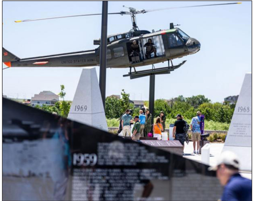
The Nebraska Vietnam Veterans Memorial was dedicated June 6, 2024, in Papillion, Nebraska. Nebraska Gov. Jim Pillen and former Defense Secretary Chuck Hagel, were joined by national, state and local dignitaries and veterans, to dedicate the memorial.

The site is truly memorable, fitting of recognizing all who served in that conflict. The 55th Wing Association is proud to be associated with it and encourages everyone to visit.