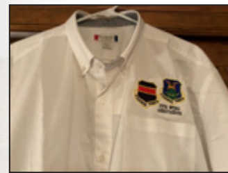
Long Sleeve 55th Association Shirt Red, White, Navy Blue. (S-XXXL). Cost $63 + $6.50 Shipping ($69.50).

Association items make great gifts for birthdays, holidays and other occasions for current and former 55th Wing member! These following items are now for sale on the association website.