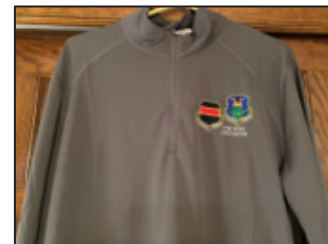
Long Sleeve 55th Association 1/4 Zip Pullovers White, Royal Blue, Red, Navy, Grey (S-XXXL). Cost $43 + $6.50 Shipping ($49.50).