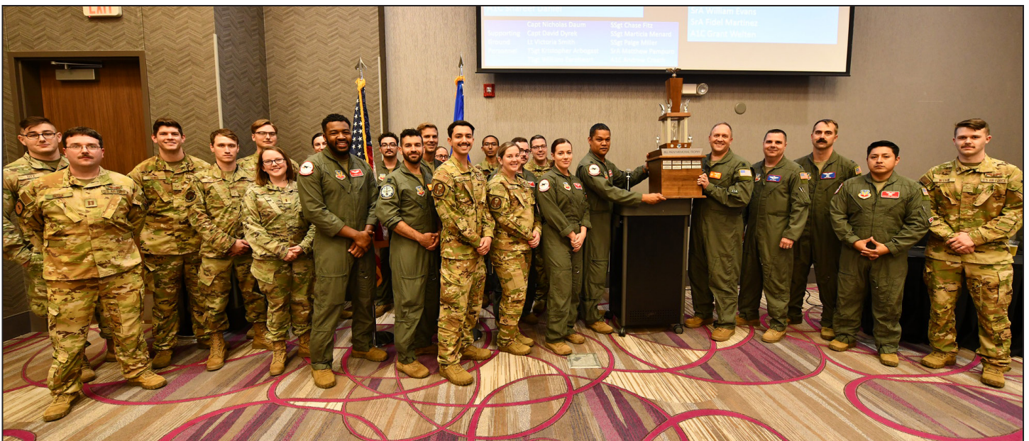
The recipients of the Maj. Bill Palm Trophy.