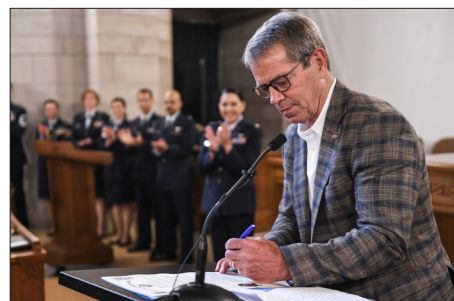
(Top) Members of the 45th Reconnaissance Squadron pose with Nebraska Governor Jim Pillen at the capitol building in Lincoln, Nebraska, June 17, 2024. (Above) Pillen signs a proclamation declaring June 1, 2024 as Wildcat Day.

Originally activated as the 423rd Night Fighter Squadron at Orlando Army Air Base, Florida in 1943, the squadron would be redesignated as the 155th Photographic Reconnaissance Squadron in the Summer of 1944 as it flew F-3 Havoc reconnaissance aircraft out of Royal Air Force Chalgrove, England, for reconnaissance missions in the European Theater. The squadron served with distinction, including flying reconnaissance support in the Battle of the Bulge.