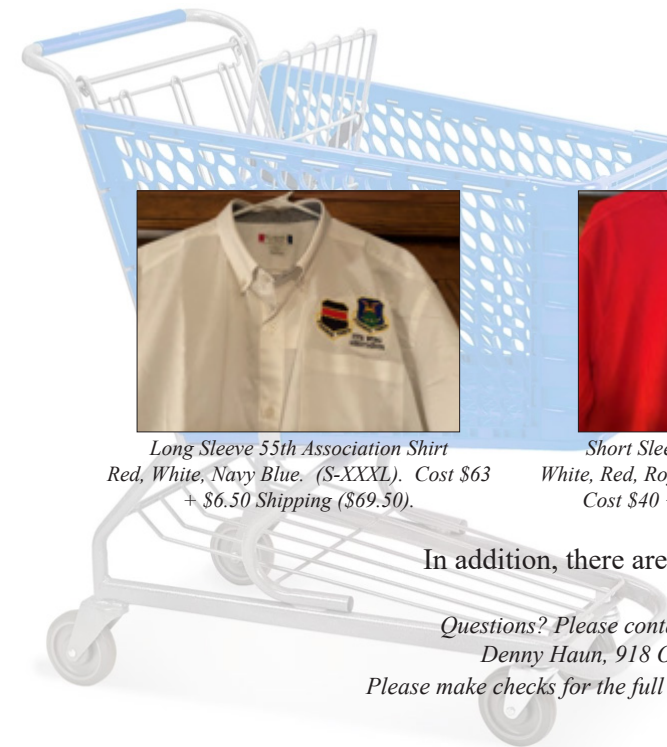
Long Sleeve 55th Association Shirt Red, White, Navy Blue. (S-XXXL). Cost $63 + $6.50 Shipping ($69.50).

Please visit the association website to see all items!