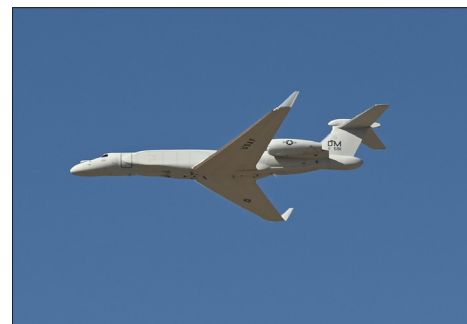
The EA-37B Compass Call replaces the legacy EC-130H as a more modern and cost-effective, commercial derivative aircraft.

capabilities in support of U.S. and coalition tactical air, surface and special operations forces.