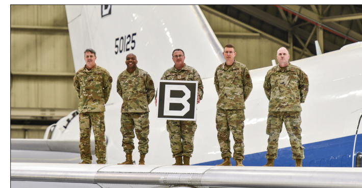
Leaders from 8th Air Force and the 95th Wing (Provisional) pose with a Square B tail designator on the wing of an E-4B at Offutt Air Force Base, Nebraska, November 1, 2024.

The wing will provide a unified command path to assure the readiness of the 595th Command and Control Group's National Airborne Operations Center, and Nuclear Command, Control and Communications mission. It will also establish a Total Force partnership to better resource the 253rd C2CG, and 610th Command and Control Squadron unique missions to other combatant commands. The consolidation will provide an enterprise view of broad command and control capabilities and improve the ability to lead, advocate and provide for resources, training and readiness.