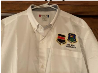
Long sleeve button down-shirt

Long Sleeve 55 th Association Shirt Red, White, Navy Blue. (S-XXXL). Cost $63 + $6.50 Shipping ($69.50).