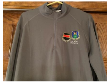
Long sleeve pullover