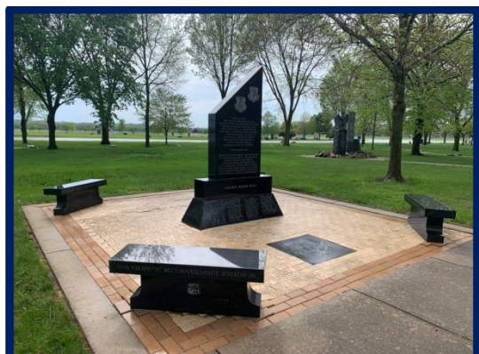
(From the front.)