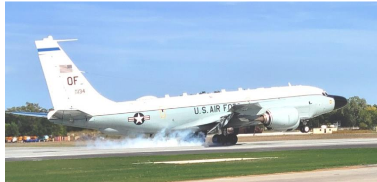
First return landing piloted by 55 th Wing Commander Colonel Kristen Thompson.

The last time a Wing aircraft had been at Offutt, the 80 years old runway was rated the worst in the Air Force! Now, the Fightin' Fifty-Fifth fleet returned to the USAF's newest runway!