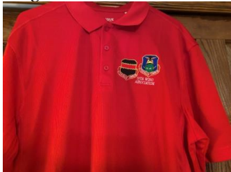
Short sleeve polo