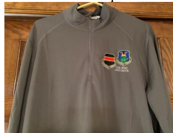
Long sleeve pullover