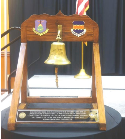
The 55 th Wing Ceremonial Bell