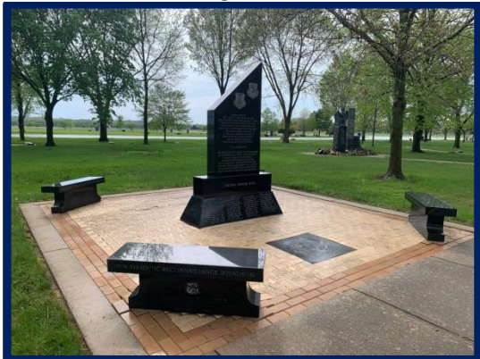
After hose down of entire memorial and ground work. (From front.)

As for the USAF Museum, they have a whole slate of events to celebrate the USAF's 75 th anniversary, including the arrival of a KC-135 for display at the air park.