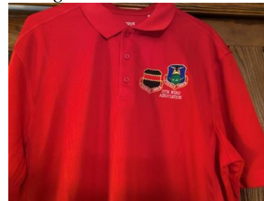
Short sleeve polo