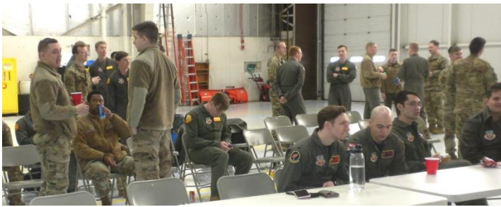
Active troops mill about at the Tales.