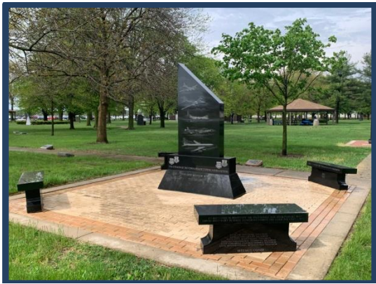
Before the clean up, moss on patio and untrimmed grass. (From rear.)

The memorial stands ready for the summer onslaught of USAF museum visitors.