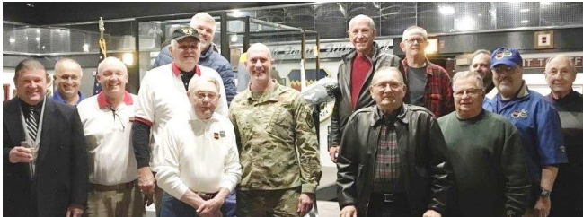
This goodly group posed on 29 December 2021 at the Museum social.