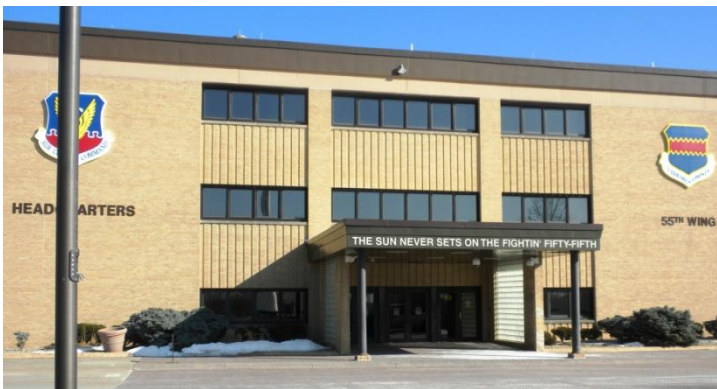
Colonel William D. Riggs Bldg,

55 th Wing Headquarters (front entrance) Bldg 500 in process to be designated Bldg 55. (Formerly SAC HQ, then USSTRATCOM HQ.)