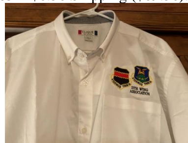
Long sleeve button down-shirt

Long Sleeve 55 th Association Shirt Red, White, Navy Blue. (S-XXXL). Cost $63 + $6.50 Shipping ($69.50).