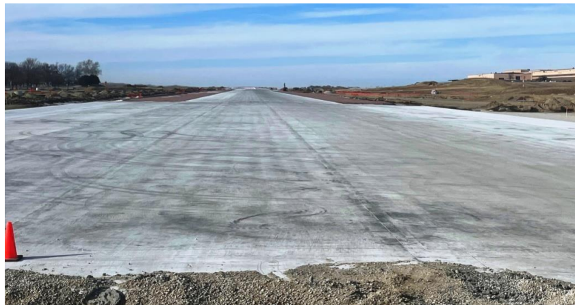
From the east end. Looking west by north. Martin Bomber Plant (Bldg D) to the far right. Taken 10 January 2022.

After tearing out the old runway and portions of the Mass Parking Area (MPA), construction crews completed just shy of one million cubic yards of earth-work during site preparation. In August of 2021, paving commenced ahead of schedule. Upon completion the contractor will have poured more than 92,000 cubic yards of concrete, plus almost 60 tons of asphalt.