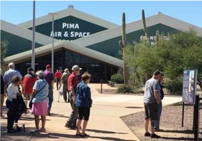
Sunny day at the Museum