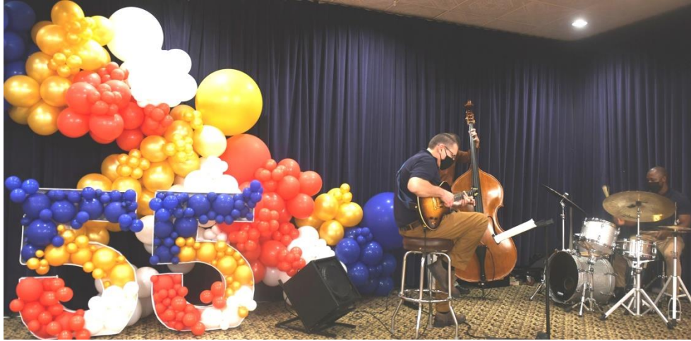
Balloons and the excellent combo.