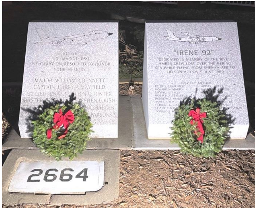
This holiday season the memorials in front the 45 th RS building were included the Wreaths Across America program in veterans cemeteries and other honored places.