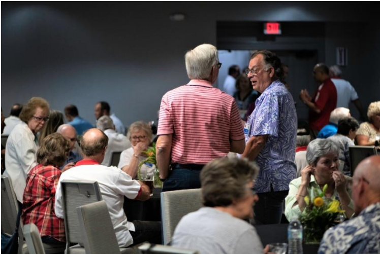
The hospitality room was a popular place to gather.