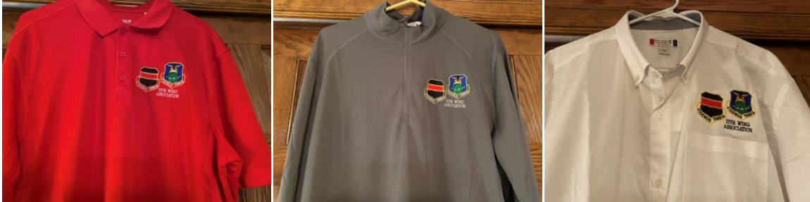
Short sleeve polo

Red, White, Navy Blue. (S-XXXL). Cost $63 + Shipping(TBD).