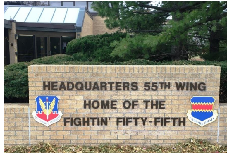
Theater entrance in background. Sign faces north.

Building 500’s theater entrance is now clearly Fightin’ Fifty-Fifth Headquarters territory