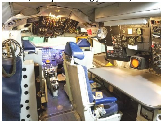
(Cockpit looking forward)

In 2018, the Museum began a grand Redevelopment Plan which now includes expanding and modifying the Museum and repositioning aircraft. The final positioning of 049 within the Museum, and the exhibits related to 049, are part the Redevelopment Plan.