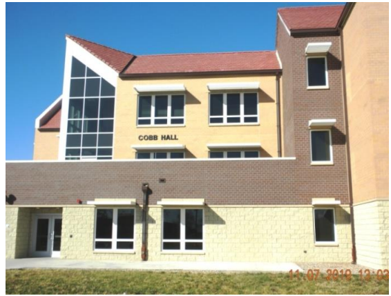
Depicted is the west-facing half of Cobb Hall with the main entrance to the lower left.

The three story, 51,000 sq ft building has 30 suites (a common area and four rooms with individual bathrooms) that can accommodate 120 airmen. It is in the dormitory complex on the hill north of Bldg C. A central dining facility is adjacent to the dorms.