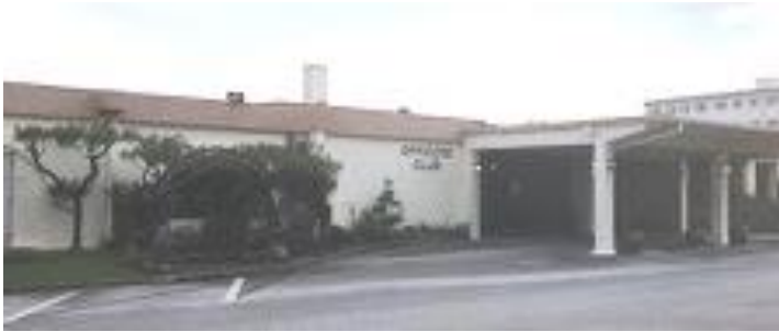
O Club with high rise billeting building seen in the far right background.

That night we had dinner at a sushi place with the 82 nd RS ops officer and about another dozen squadron mates.