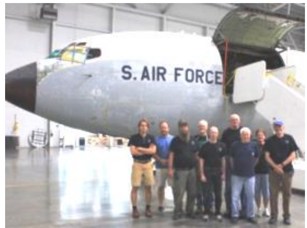
Just some of the stalwart volunteers Taken earlier this year.

The Museum staff intends to test paint the exterior starting in November. The Museum has reconnected with the PPG paint company and it has renewed its pledge to provide primer and paint for the exterior.