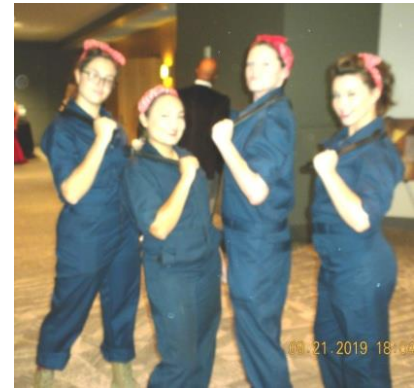
Rosie the Riveter and co-workers showing some muscle.

The ceremonies also included the presentation of the 55 th Wing Association Award for Excellence and introduction of the 2019 55 th Wing Hall of Fame inductees.