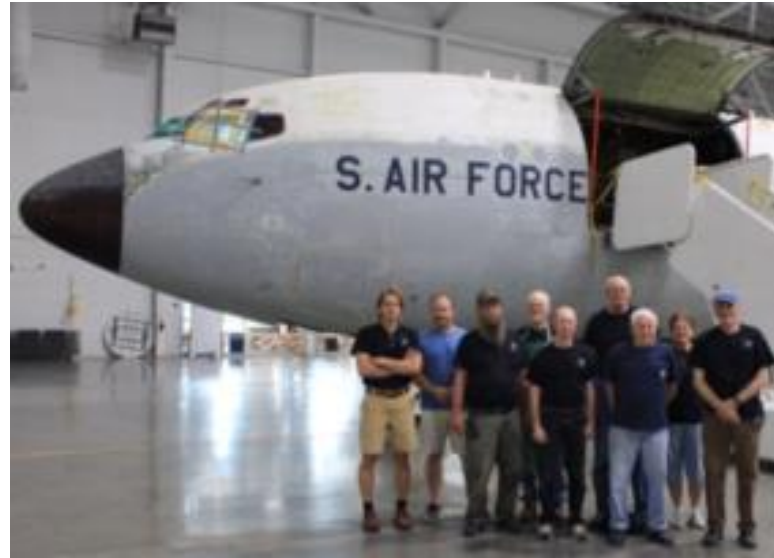
EC-135 tail #049 and a dedicated group of restoration volunteers.

picked up, there is still a lot of work to do and no detail is overlooked.