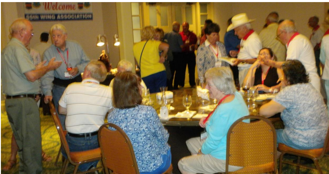
Attendees enjoying camaraderie, food and beverages at the Thursday evening reception.