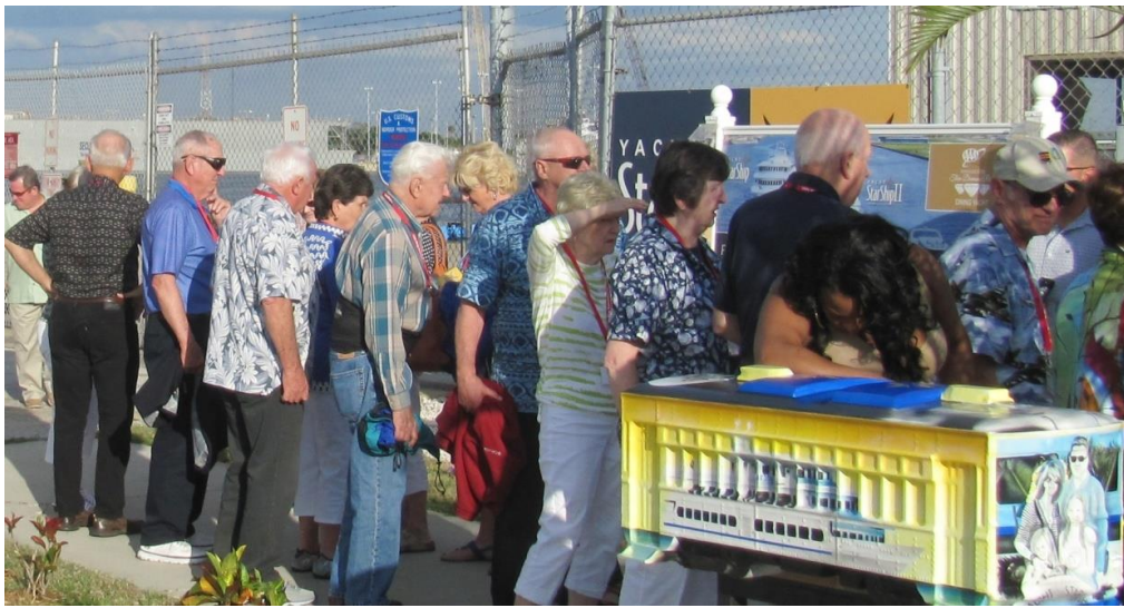
The Star Ship (previous page) and our hardy crew await boarding.