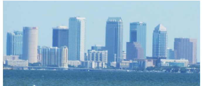
Tampa skyline from MacDill AFB.