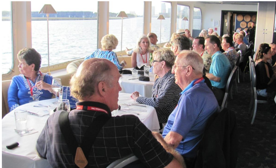
On the non-bounding Tampa Bay, It was smooth sailing and good food.