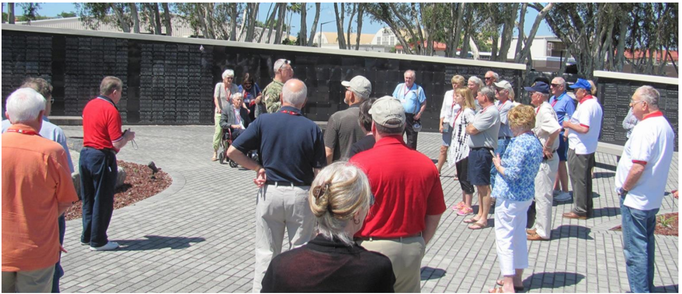
Basking in the Florida sun at the impressive Special Operations Command Memorial.