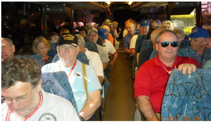
Are we there yet?