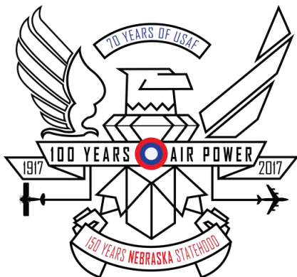
Logo by Josh Plueger, 55 th Wing PA.

The heritage of the Fightin' Fifty-Fifth will be covered in the program script.