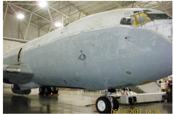
049 Sanded and prepped for painting, June 2017

Outside the aircraft, the volunteers continue to prepare the frame and skin of the aircraft for priming and painting.