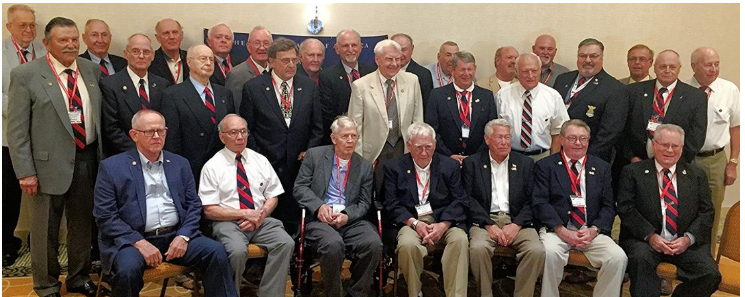
Traditional lodge photo: 'The mens', Vietnam and Cold War veterans all.