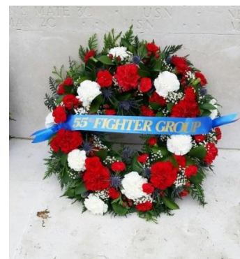
The wreath honoring the 55 th Fighter Group.