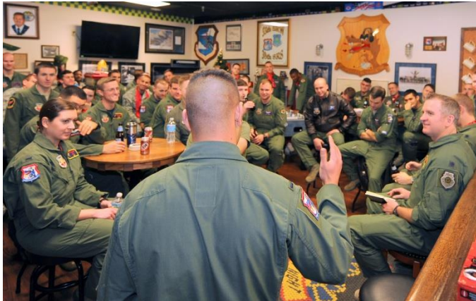
38thRS roll call 9 January 2015

Squadron commanders hold roll calls with the assistance of an elected crewman designated as "mayor". It is usually standing room only as the commander holds court.