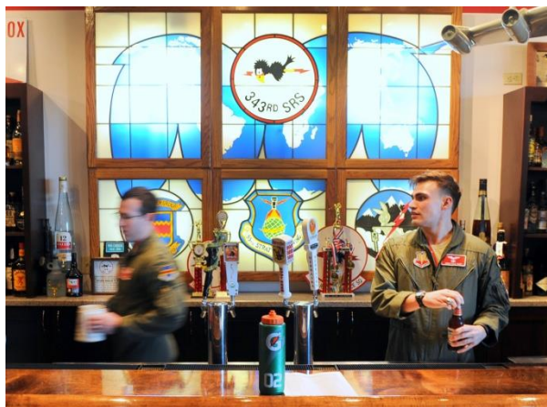
A duo of crewdogs tend bar in the 343 rd 's Hoover Lounge. Note the 55SRW shield at lower center of back-lit wall.