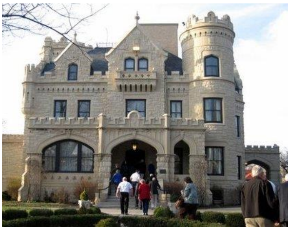
Joslyn Castle, famous Omaha landmark, site of the Thursday evening dinner.