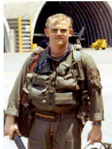
Our Fearless Leader as a FAC in 'Nam 1972