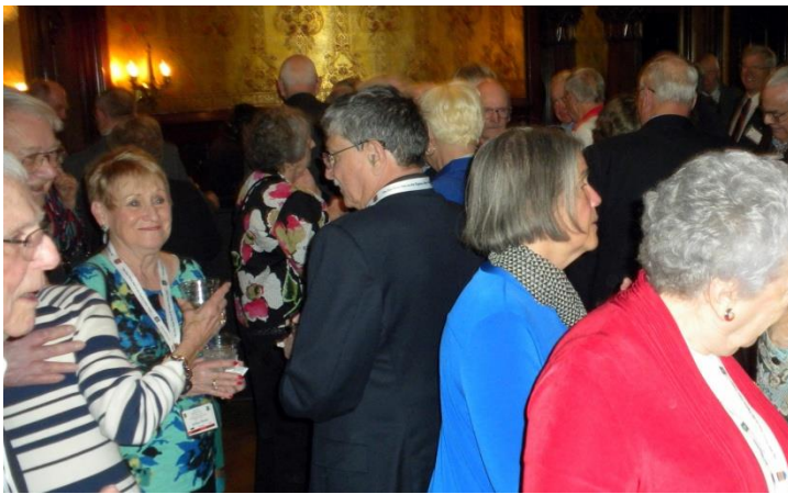
Another bar scene. Is there a pattern here?