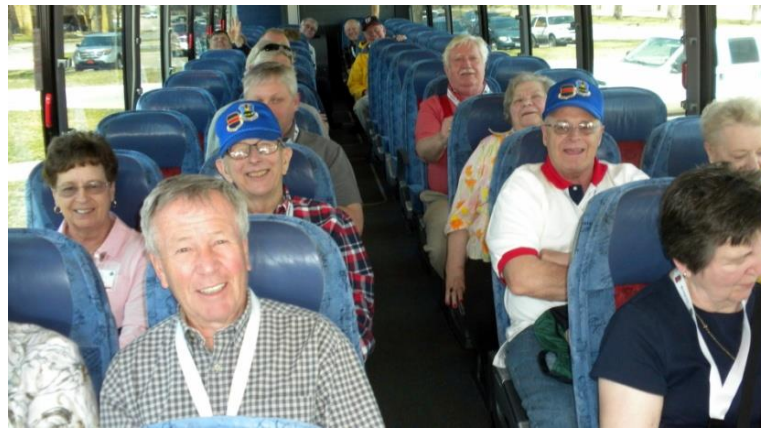
We are having fun now!! .....well, aren't we?