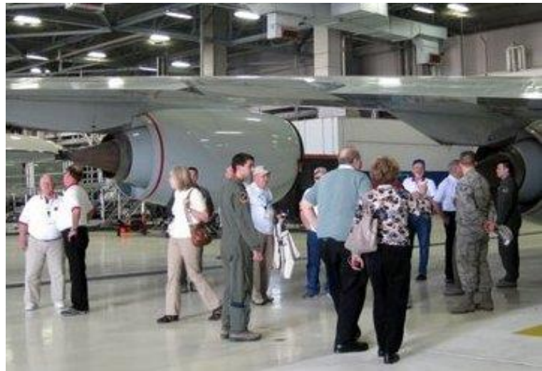
Now, folks, this here is an air 'chine, and y'all helped pay for it.