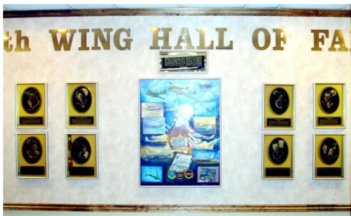
Wall in a hallway near the Command Section of the 55 th Wing HQ building dedicated in January 2003.

The 2003 inductees, who first came through that process, were LtCol (Ret) Hobart (Matt) Mattison , a 55 th SRW RB-47 aircraft commander who recovered a severely damaged recon aircraft that had been shot up by North Korean fighters over the Sea of Okhotsk; and LtCol (Ret) Roy (Pop) Kaden , an early Cold War 55 th SRW RB-50 crew commander and strategic reconnaissance pioneer.