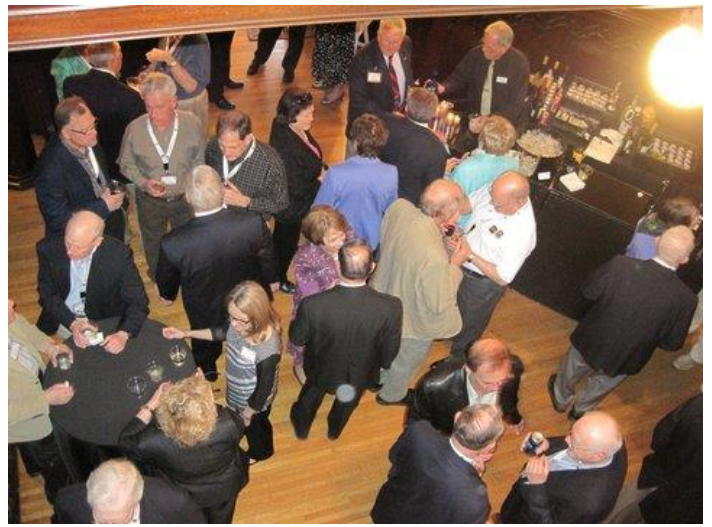
Bar scene at the Joslyn. Must be a 55 th crowd.