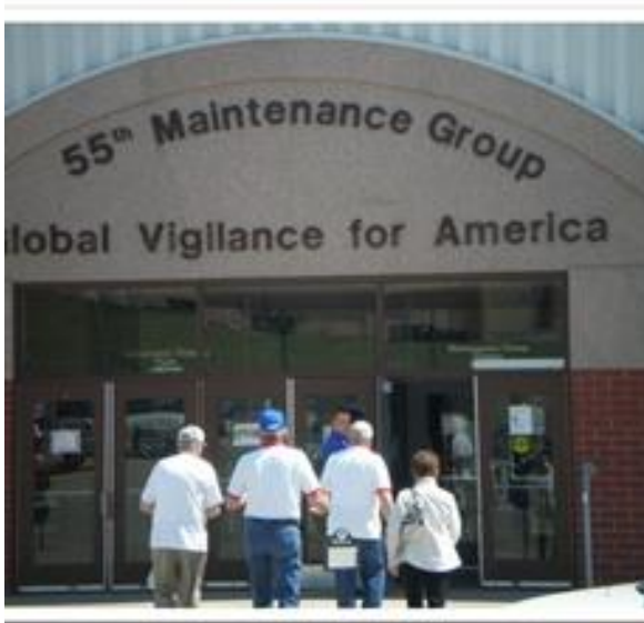
Let's see what's in this building.