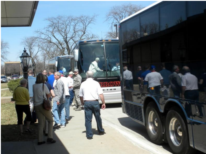
Get on the bus. Get off the bus. Touring Offutt.