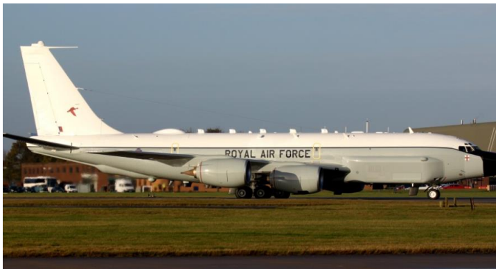
Airseeker taxis in at RAF Waddington

The aircraft departed Greenville, TX, where the conversion was accomplished by L-3 Communications personnel, flying to Bangor, ME, for a refueling stop. Using call sign 'SAME 40', then continued to make the trans-Atlantic crossing, changing to call sign 'Vulcan 51' when it transferred to UK military air traffic control.