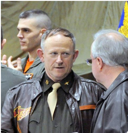
The prez in WWII uniform, smoozes during a break at the 2013 Tales event.