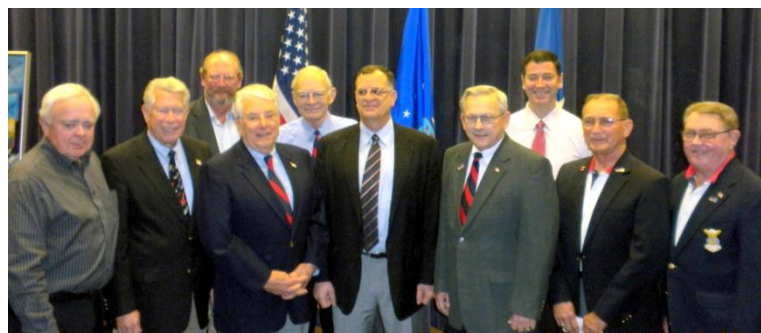
Members of the Hall of Fame do the lodge pose.