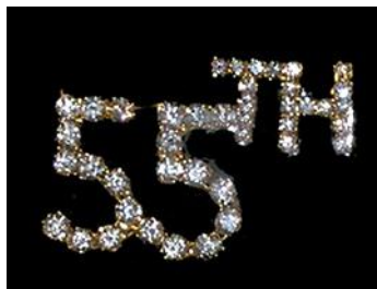
(Shown as actual size)

The pins continue to be sold to Association members all over the country. They are particularly evident at official and social functions at Offutt, and at 55 th reunions.