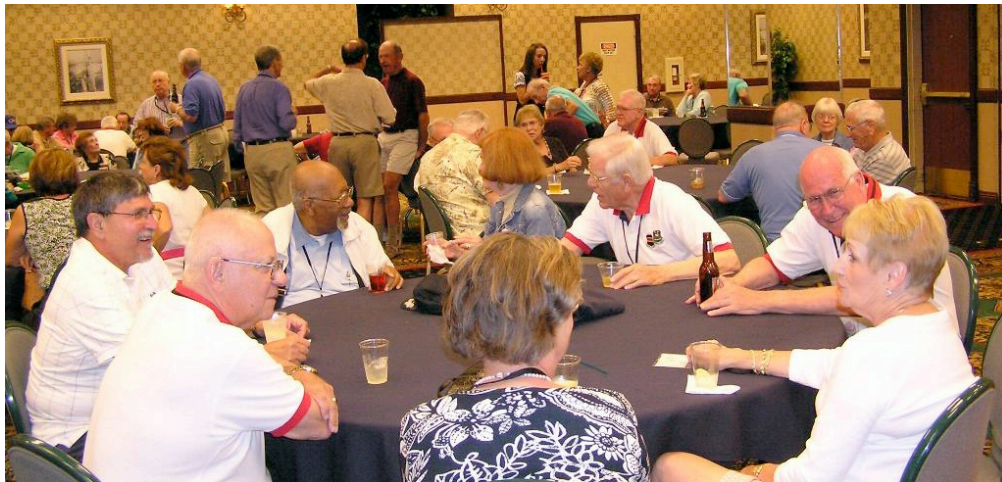
Reno September 2009

Dead comrades, hearing their names spoken, wanting to share in the time, if only in spirit, move silently among them. Their presence is felt and smiles appear beneath misty eyes. Each in his own way may wonder who will be absent in another year.