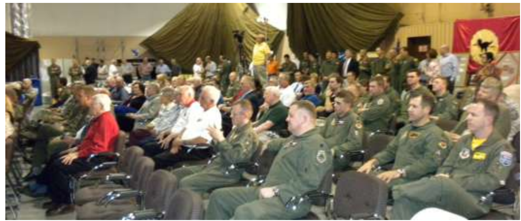
Another large audience gives its rapt attention to the 'war stories'