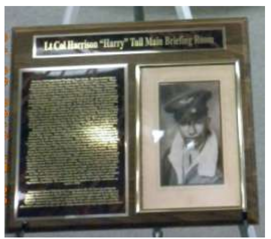
Plaque with Tull's biography and WWII Tuskegee photo. * * * * *

The day's activities continued as some of the assemblage moved down the hall to 'rechristen' the Hoover Lounge amongst the current crewdogs of the 343<sup>rd</sup>. LtCol Krishna welcomed Hoover back to his name sake 'crew relaxation' area that had been recently and completely renovated since its original dedication in July 2006.