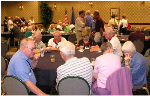
.....And there I was.....