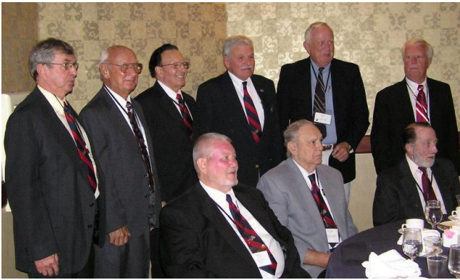
Some oldies but goodies