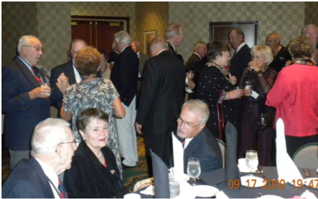
Banquet Social Hour