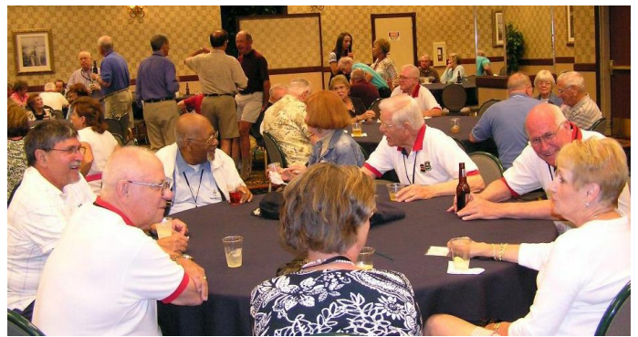
A goodly group yaks it up