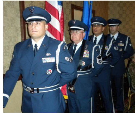
AF Reserve Color Guard