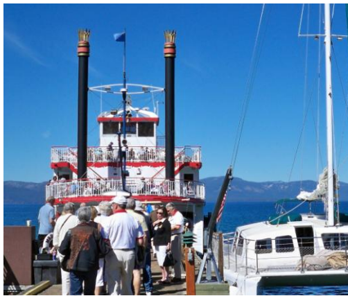
MS Dixie II awaits