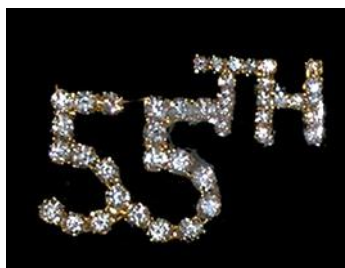
(Shown as actual size)

As a direct result of newsletter notices, the pins continue to be sold to 55SRWA members all over the country. They are particularly evident at official and social functions at Offutt and at 55 th reunions.