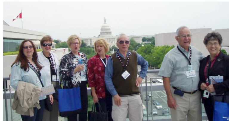
Some of the tour group on the Newseum observation balcony with a Capital view.

The nation's capital offered more museums and monuments than there was time to visit. But getting to the Air Force and World War II Memorials was worth the trip. Walking tours of the Capital Mall, the Pentagon, and Arlington National Cemetery were among the numerous attractions.