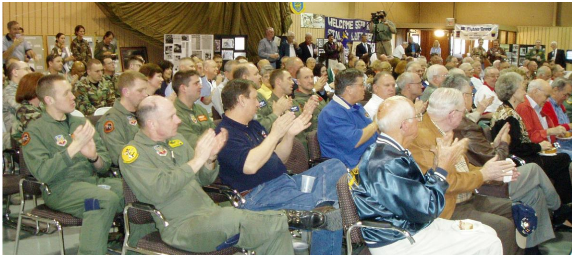
Part of the appreciative packed audience.