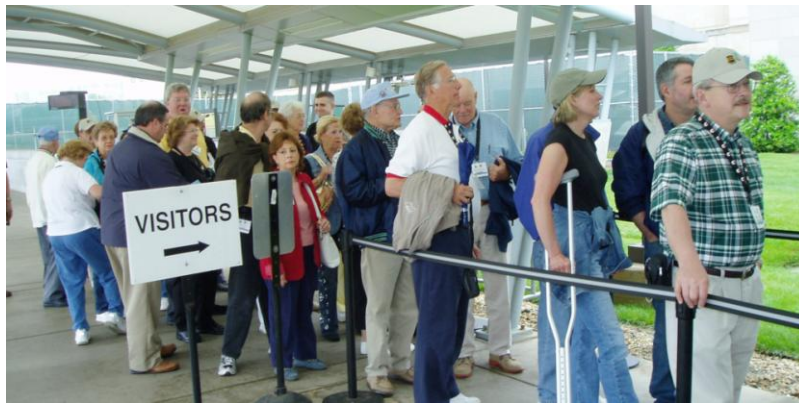
Security lineup of shady characters at the Pentagon.