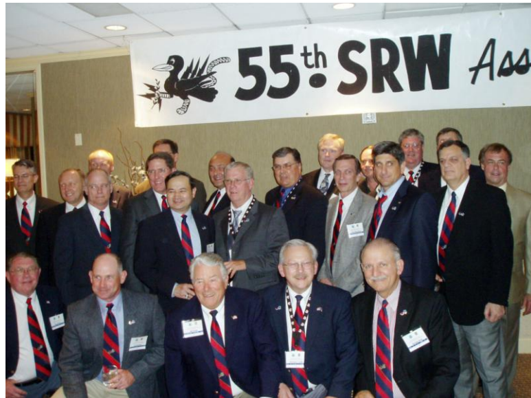
America's Most Wanted - Up Against the Wall!!!!