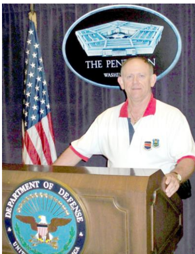
Our peerless leader.