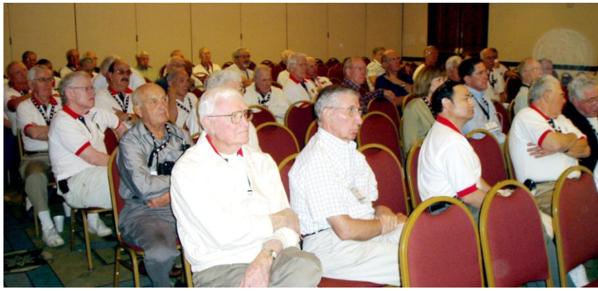
Members are intent at the Saturday a.m. meeting. Yes, indeedy.