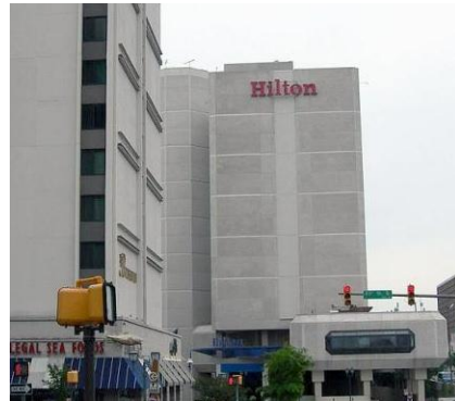
Reunion Headquarters Crystal City.