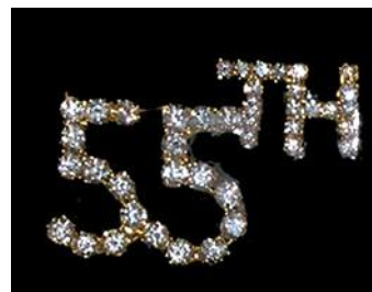
(Shown as actual size)

(If the ol’ dude doesn’t take the hint, ladies, order one for yourself.) Classy, but inexpensive.