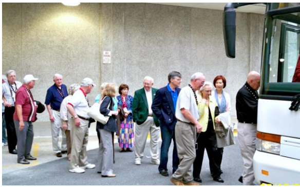
Get on the bus, get off the bus.