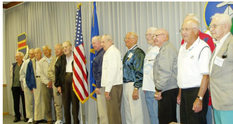
Veterans of the "Greatest Generation"

The festivities wound up with a banquet on Saturday, 24 May.