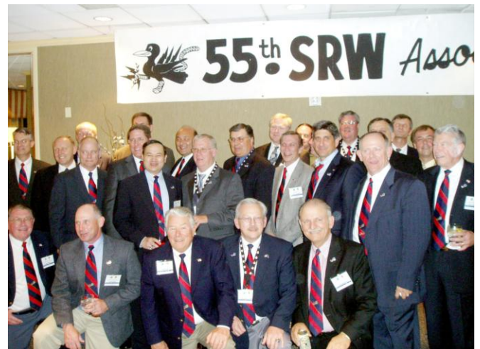
Nice ties, guys