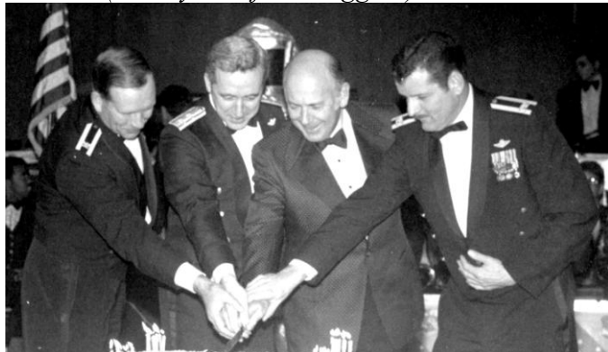
The first Birthday Ball cake cutting, January 1979.