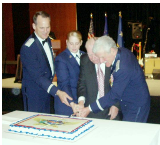
Cake cutting ceremony April 2008.