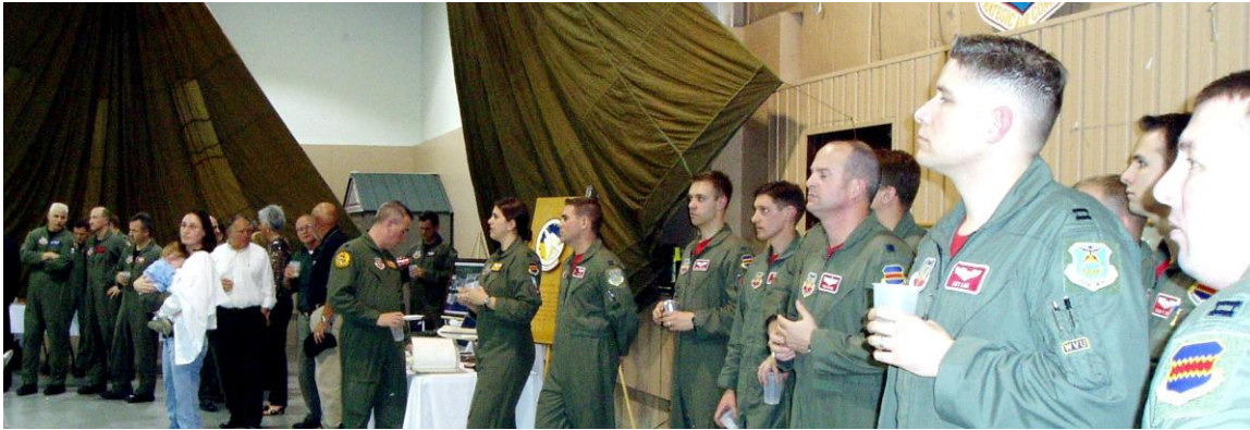
Standing crewdogs only.