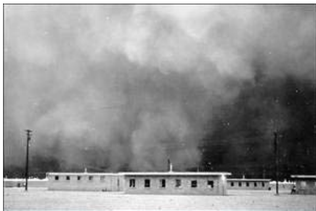
Moroccan Sand Storm

Ben Guerir AB was situated about 36 miles north of Marrakech and was in a flat, rocky plain with desert-like conditions. Housing was in 32 foot by 16 foot plywood huts. Latrines were concrete block buildings and were almost always flooded. We had to wade through six inches of water to get to the showers, then stand on planks resting on concrete blocks while showering.