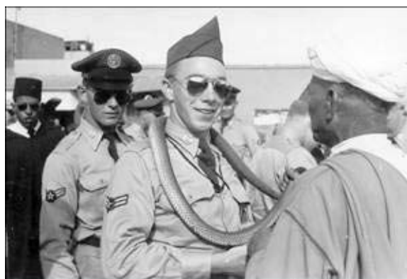
The author with snake charmer in Morocco.

One day we borrowed a thermometer from the hospital and measured the temperature in the RB-47 navigator's position. It registered 157 degrees F. That night in the outdoor theater the temperature measured 50 degrees, a swing of 107 degrees in one day! That was the desert for you.