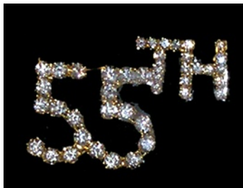
(Shown as near actual size)

occasion. Gents, it makes a great birthday, anniversary accessory gift, or holiday stocking stuffer. Classy, but inexpensive.