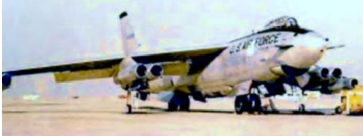
The EB-47E Tell-Two model was a bomber with the bomb bay modified into an EWO compartment and with 'black boxes' specifically to monitor missile telemetry.

In the summer of 1964 a 55 th SRW crew flying the EB-47E Tell-Two model, comprised of AC-LtCol Leo Legard, CP-Capt Floyd Braeske, Nav-LtCol Walt Stoll, Raven1-Major Willard Ladnier, R2-Capt Irving Wisner , (all ranks were theater spot-promotions as was the custom of the time), at Incirlik AB, Turkey (OL-4), flew 20 alert sortie missions in the period 22 July – 25 September without a late take-off or abort. Most likely a record for the wing and maybe all of SAC.