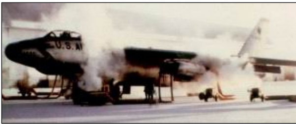
RB-47H at Thule AB