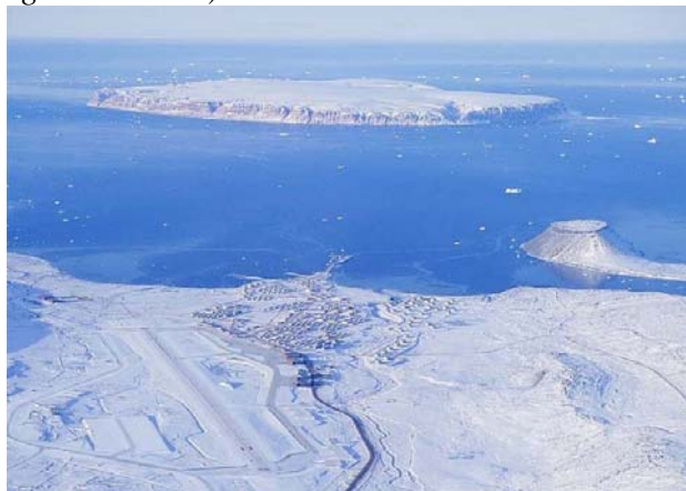
Aerial View of Thule AFB – Circa March-May 1956

Wow! On ALL those overflights! SAC must have had some really inept navigators back in those days! (This comment, by the author, also made with tongue in cheek.)