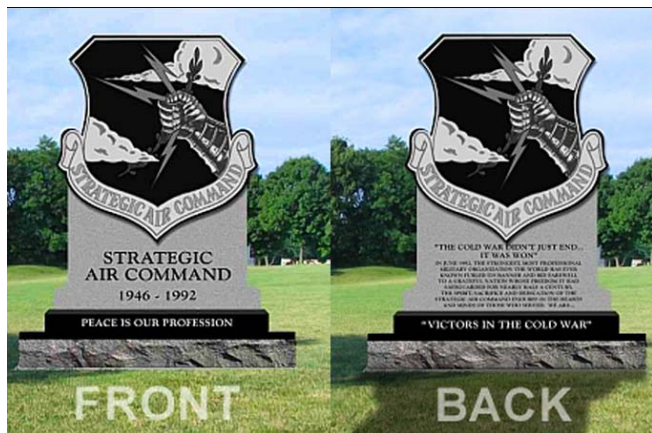
Design depiction by Dodds Monuments of Xenia, OH

The SAC Memorial project is an effort by veterans and former component organizations of SAC to erect a monument at the National Museum of the US Air Force Memorial Gardens near Wright-Patterson AFB, OH.