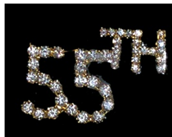
(Shown as near actual size)

occasion. Gents, it makes a great birthday or anniversary accessory gift. Classy, but inexpensive.