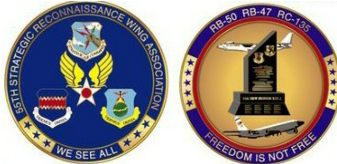
Coin shown as actual size