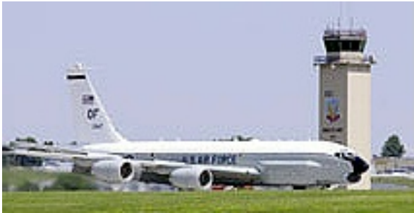
For truth in journalism: the Offutt tower depicted was recently razed and has been replaced by a new state of the art control facility.

On 11 January 2007, the 55 th Wing commemorated 6000 continuous days of operations in the Middle East at a ceremony in the Davis Maintenance Facility at Offutt AFB. Those missions began with the first Gulf War in 1991, when Iraqi invaded Kuwait, and have continued unabated through the War on Terror and Operation Iraqi Freedom.