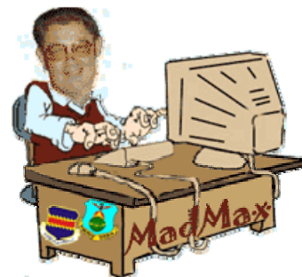
(Graphic courtesy of Patricia “copper” Gros’.)