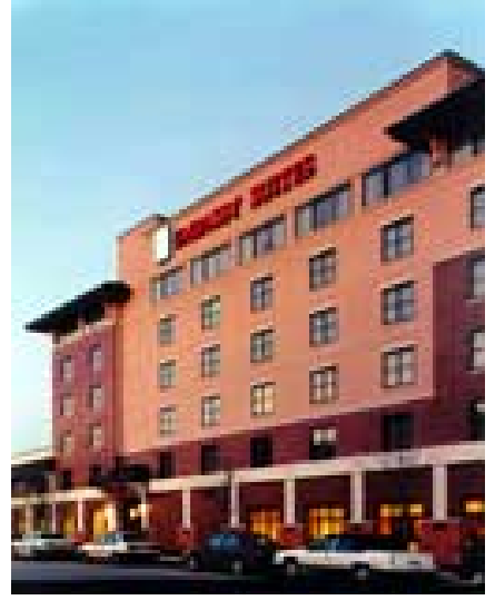
EMBASSY SUITES DOWNTOWN/OLD MARKET

The IDs are needed to get the special reunion rate of $119 for single and $124 for double occupancy (plus taxes and fees, 16.46%). The rate is good for three days either side of the 20-24 September 2006 reunion dates.