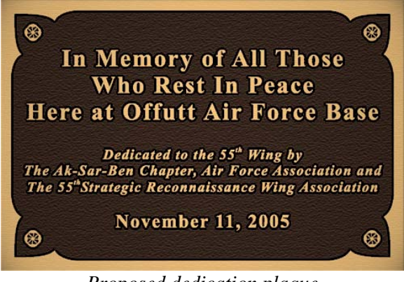
Proposed dedication plaque

The flag is flown over the cemetery, and as we go to press, the CE troops of the 55<sup>th</sup> are putting the final touches on the surrounding brickwork and lighting. We are planning for a formal dedication on Veteran's Day this November.