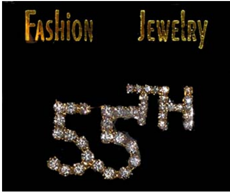
Pin shown near actual size