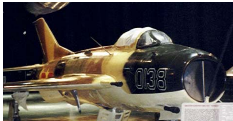
MiG-19, an old adversary lurks.