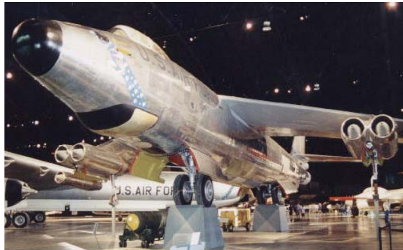
RB-47H, 4299 in all its glory.

OI' 4299 has a prominent placement in the center of the Cold War annex, majestically set upon pedestals. In an inspired touch, there is a MiG-19 poised off the left wingtip of the RB.