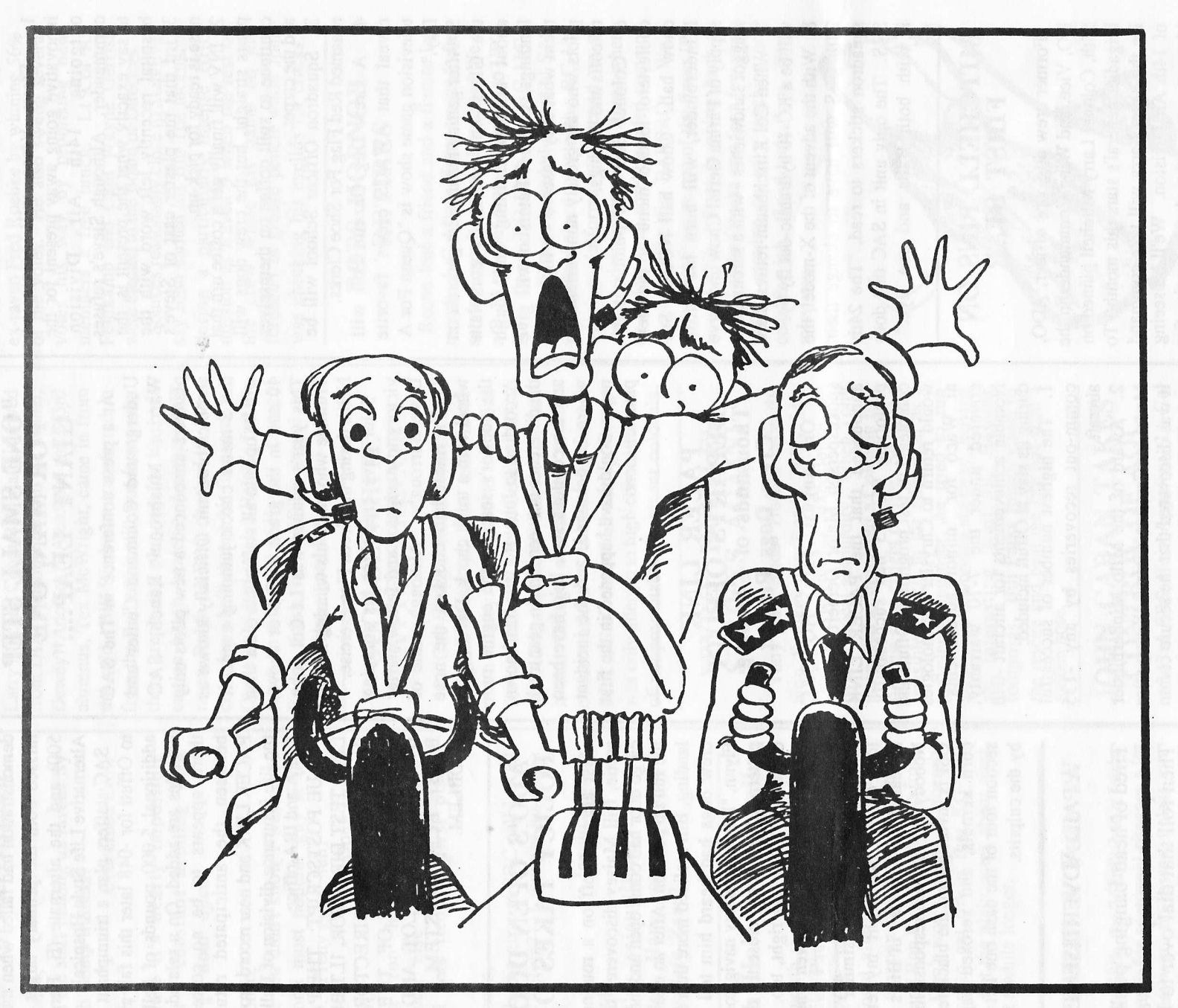
THE GENERAL'S LANDING