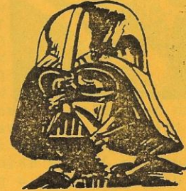
COL D. VADFR